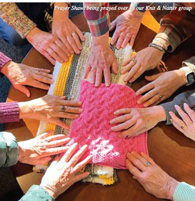
Prayer Shawl being prayed over by our Knit & Natter group