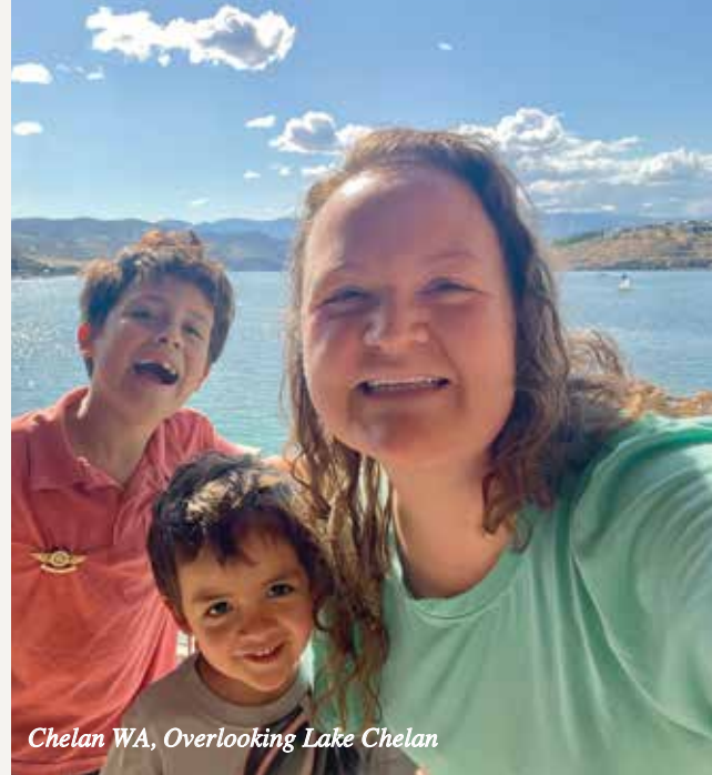
Chelan WA, Overlooking Lake Chelan