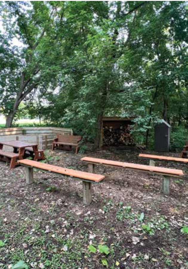
Gaga ball pit, storage, picnic tables, & restored seating