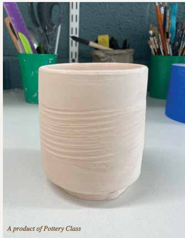
A product of Pottery Class