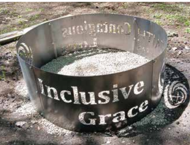
New firepit at Faith's outdoor area

I want to thank the Pastors for supporting the idea of this project. I hope Faith members will enjoy using the space.