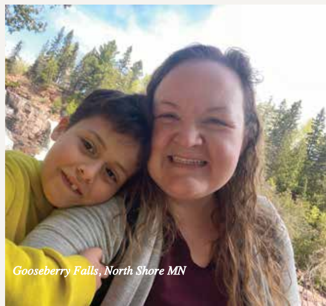
Gooseberry Falls, North Shore MN