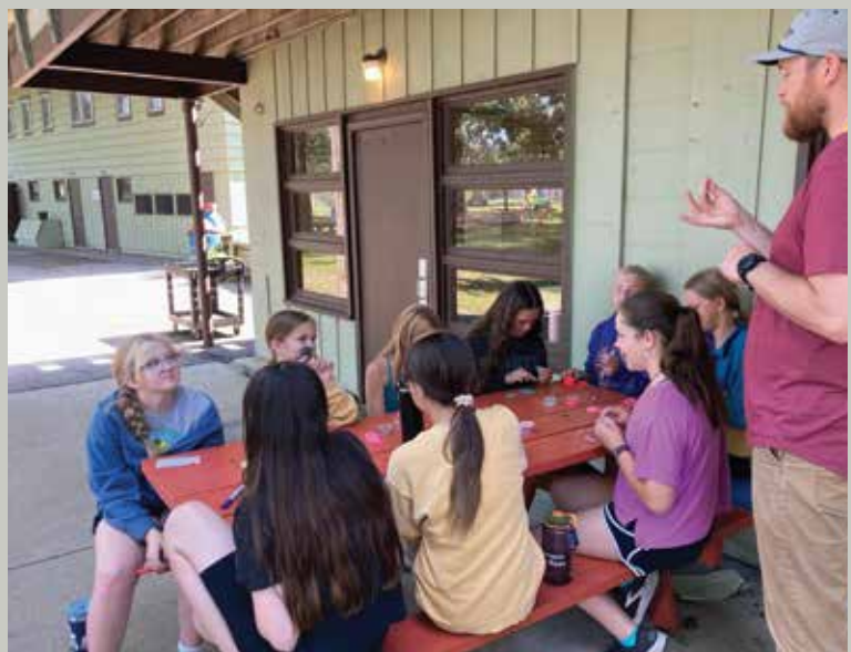
Using dough to interpret Monday's theme of Creation