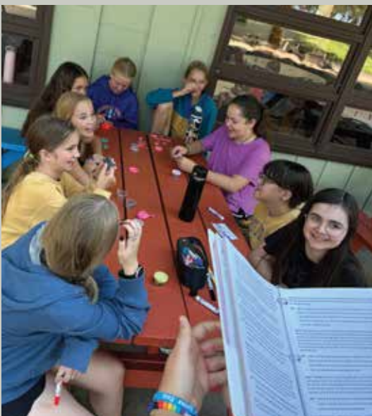
Bible Study at Green Lake