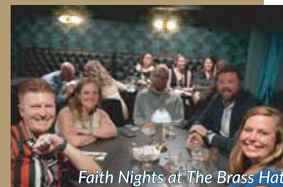
Faith Nights at The Brass Hat

Social gatherings for those 55+ is starting up again! They had a potluck in mid-November, and look forward to more opportunities to gather moving forward!