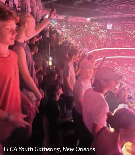
ELCA Youth Gathering, New Orleans