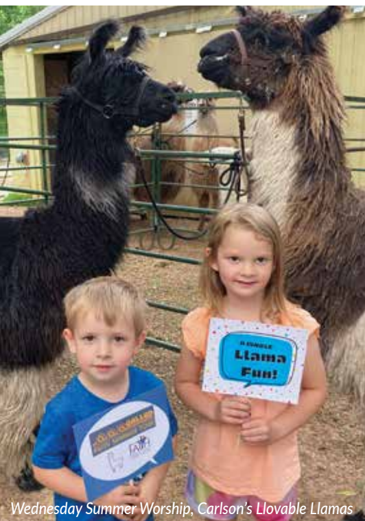
Wednesday Summer Worship, Carlson's Lovable Llamas