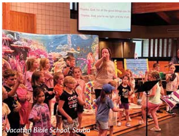
Vacation Bible School, Scuba