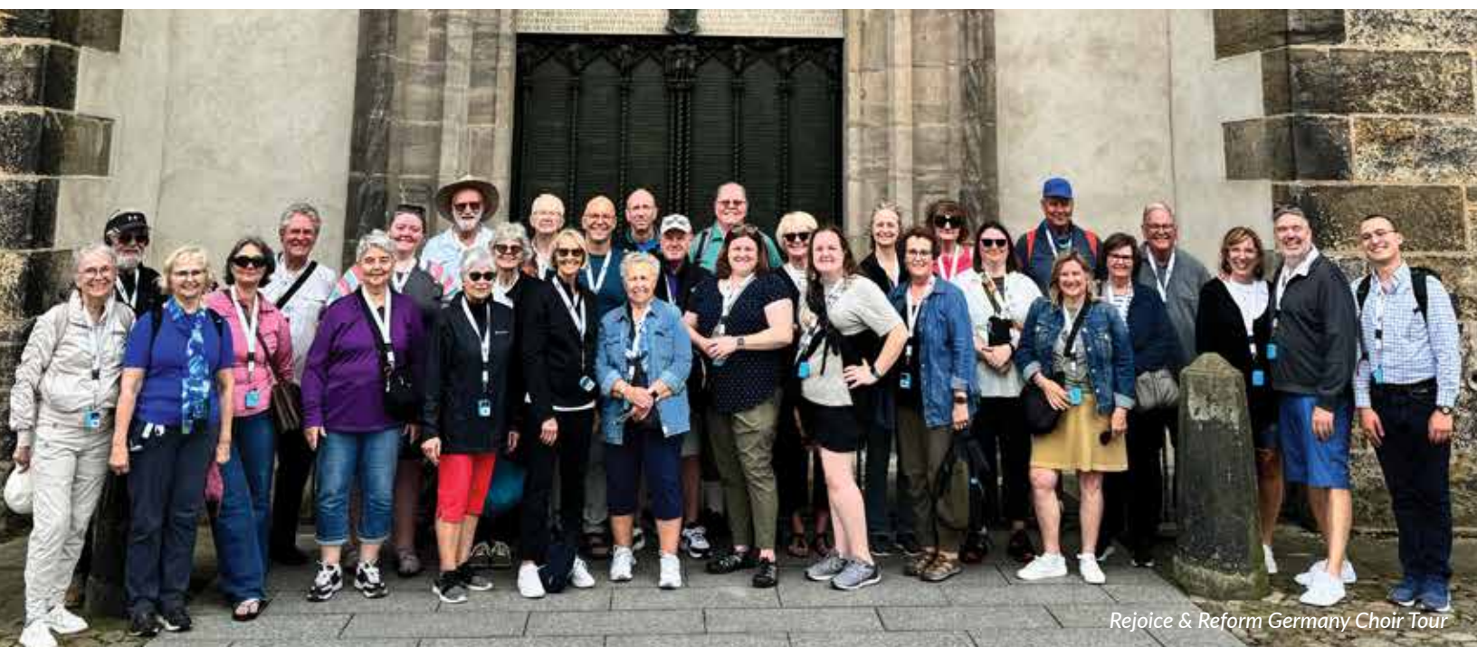
Rejoice & Reform Germany Choir Tour