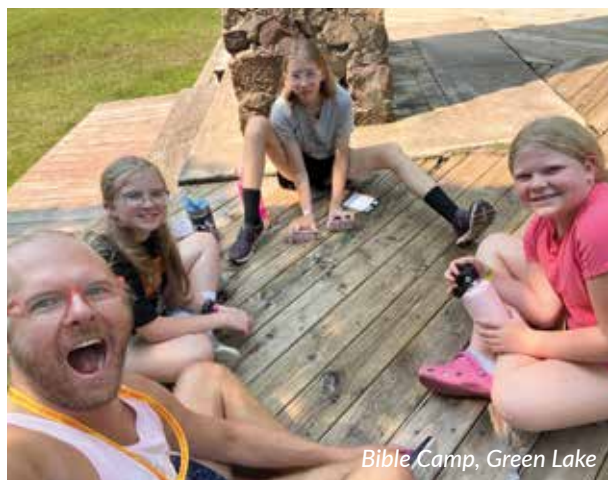
Bible Camp, Green Lake