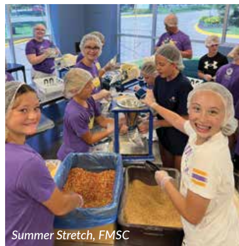
Summer Stretch, FMSC