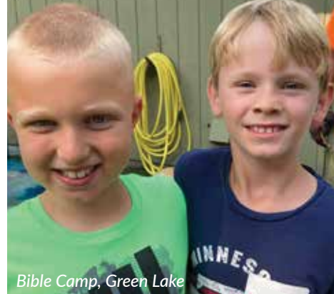
Bible Camp, Green Lake