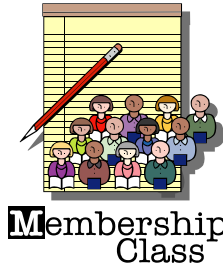
M embership Class

provided. Please call the church office (442-2101) to sign up. New Member Sunday will be February 12.